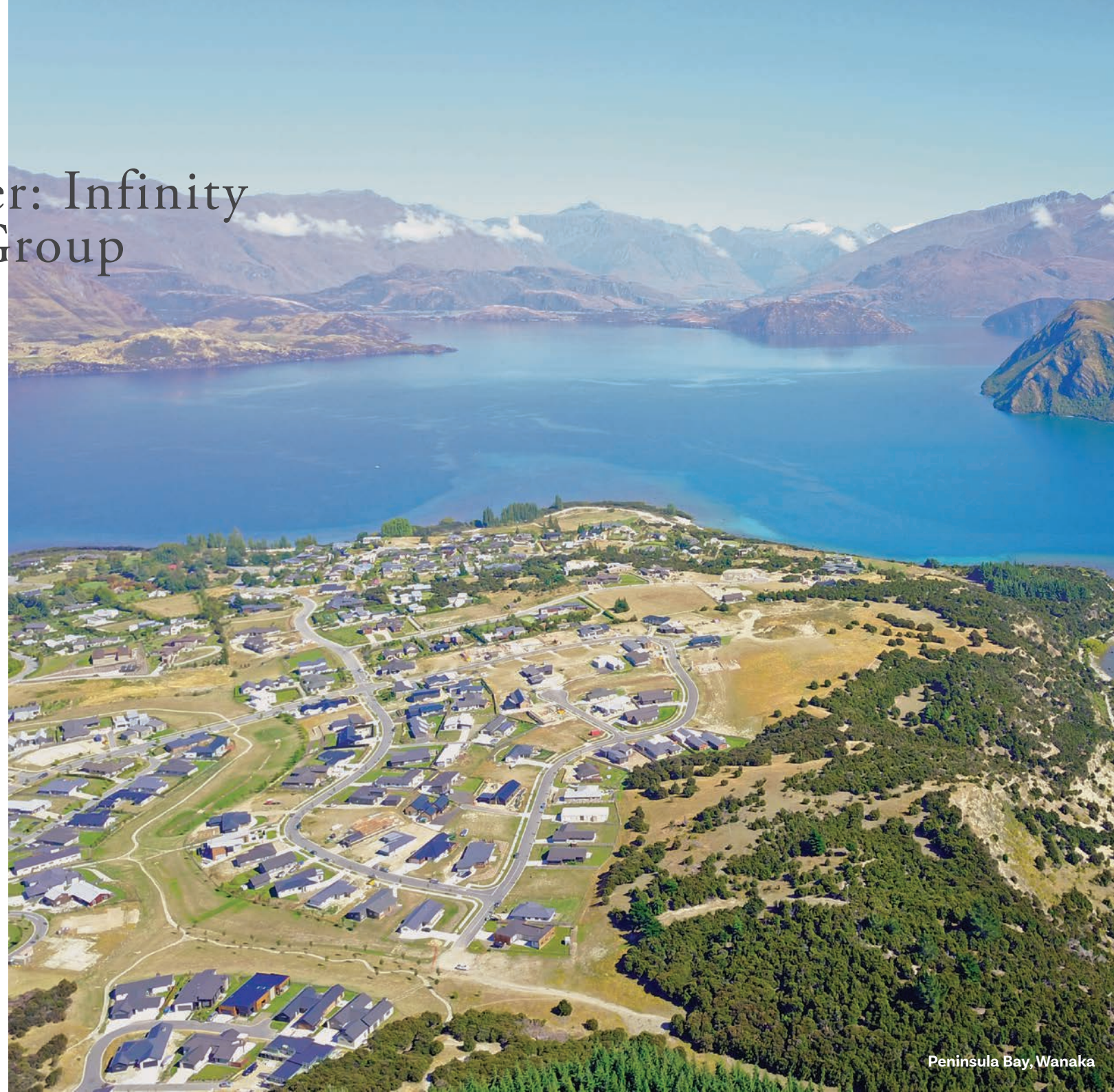
Peninsula Bay, Wanaka