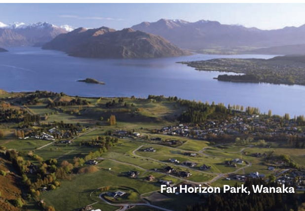
Far Horizon Park, Wanaka

Infinity Investment Group are thrilled to be back in Central Otago creating another exceptional development in the desirable Shannon Farm. NZ Cherry Corp (Leyser) LP is the owner of Shannon Farm, of which Infinity has 50% ownership.